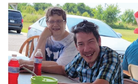
ENJOYING THE OUTDOORS TOGETHER