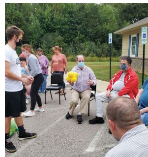
MORE FUN AND GAMES TOGETHER