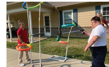
GETTING CREATIVE WITH EXERCISE