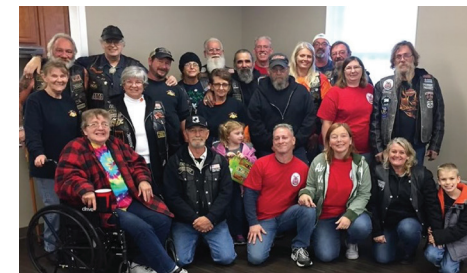
CELEBRATING AFTER THE CEREMONY