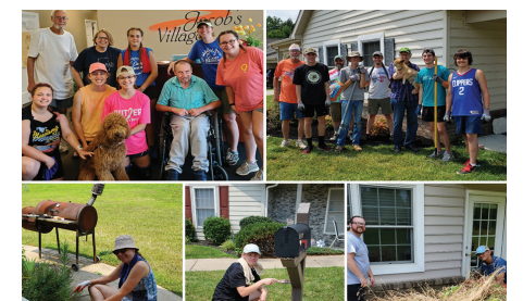
CAMP BROSEND VOLUNTEERS