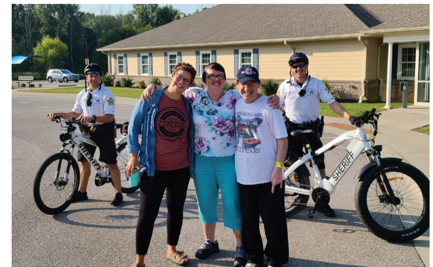
RESIDENTS ENJOYING OUR SPECIAL VISITORS