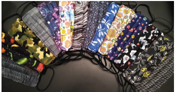
BEEKIND COMMUNITY DONATED COLORFUL MASKS