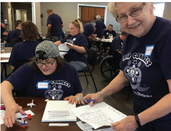
CONCORDIA BIBLE CAMP