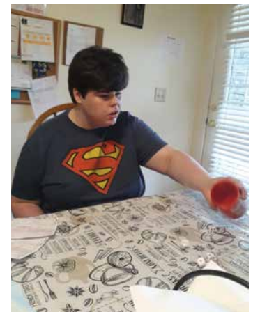
PAINTING WITH HOUSEMATES