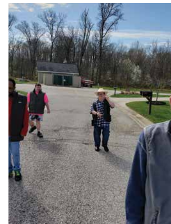
OUR AFTERNOON WALK