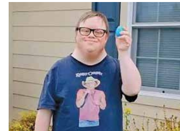
EASTER BUNNY VISITED JV