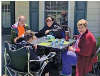
OUTDOOR QUARATINE BINGO