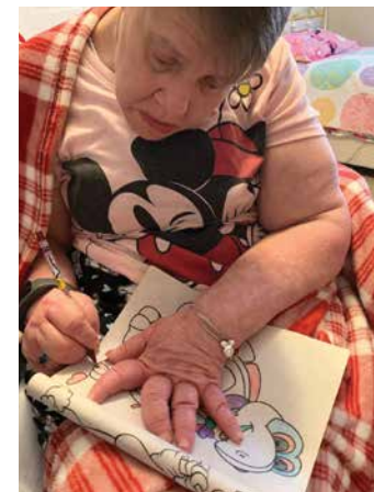
ENJOYING CRAFTS AND COLORING