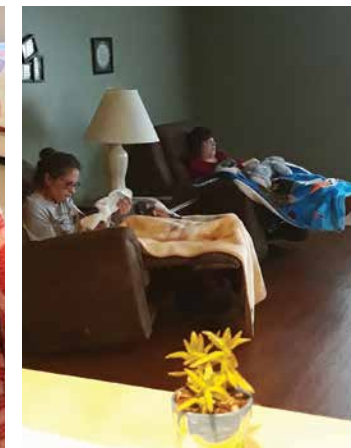
NEEDLEPOINT AND RELAXING