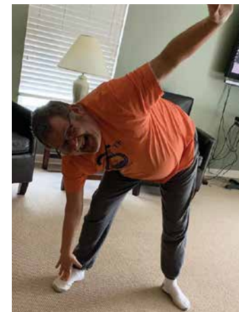
EXERCISING AND STAYING HEALTHY