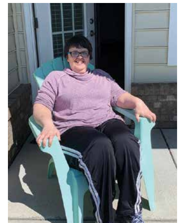
SOAKING IN THE SUNSHINE