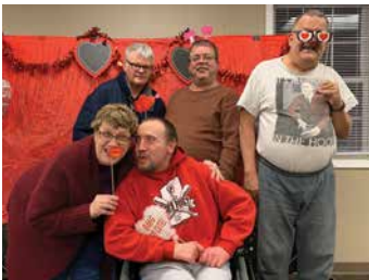
VALENTINE'S DAY SILLINESS

Established in 2004, the mission of Jacob's Village is to develop a safe, walkable, neighborhood community where people with disabilities and older adults can find meaningful relationships, housing that is affordable and accessible, and activities that encourage active minds and bodies. More information can be found by visiting www.jacobsvillage.org or facebook.com/JacobsVillage