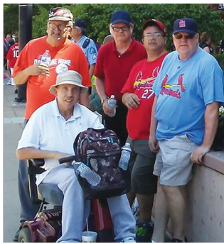
ST. LOUIS CARDINALS BASEBALL TRIP