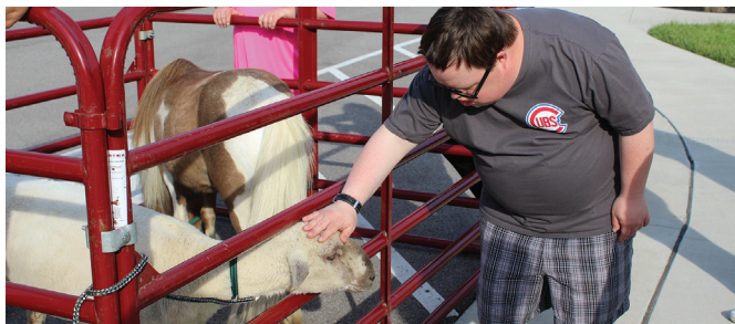
PETTING ZOO FRIENDS