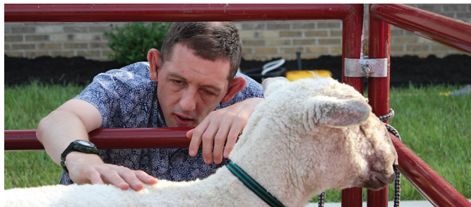
PETTING ZOO FRIENDS