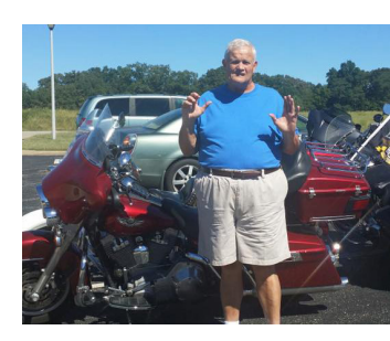
American Thunder members delighted our residents before their charity run