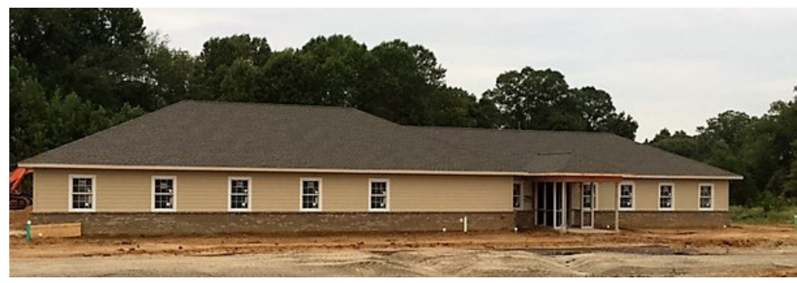
Community Center slated for completion in mid to late November

us at 812.963.5198 to set up a tour or stop by and drive around the community at your leisure. Look for more details on the spring ribbon-cutting after the New Year!