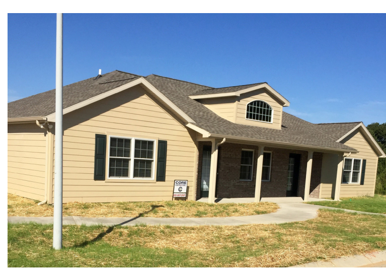
Newly built Men's home ready for occupancy October 1

We hope you will be able to join us for the center's ribbon-cutting in early spring, but we also encourage you to visit us before then, to see how your generous donations are impacting lives. Just call