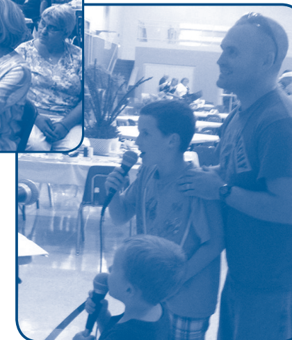
Guests sing Christmas karaoke!

for Jacob's Village! We are grateful Jacob's Village residents benefitted from this fun event and wish to extend a heartfelt thank-you to all of the churches involved including Zoar UCC, St. Wendel, St. Paul's UCC, St. Joe's County, Resurrection and St. Philip's!