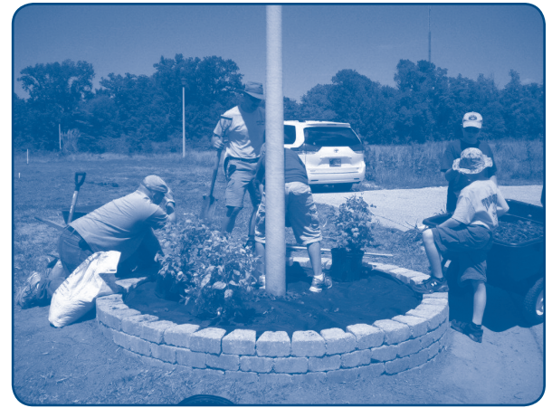
Volunteers hard at work beautifying the landscape.

We would love to hear from you if your group has interest in Adopting-A-Spot at Jacob's Village. You'll offer us a great blessing by volunteering and you'll be rewarded with lots of smiles and high fives