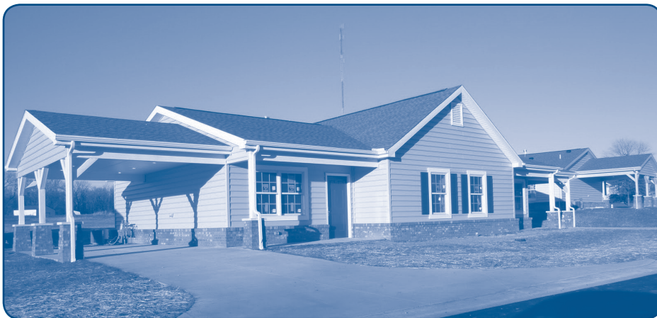
Brand new accessible apartment at Jacobs Village.

We ask that you continue to spread the word about the remaining apartments by talking about them to everyone you meet, by inviting our staff to speak to any organization of which you're a member, and of course by visiting us (with friends, we hope!) to see for yourself why our residents are so proud to call Jacob's Village home.