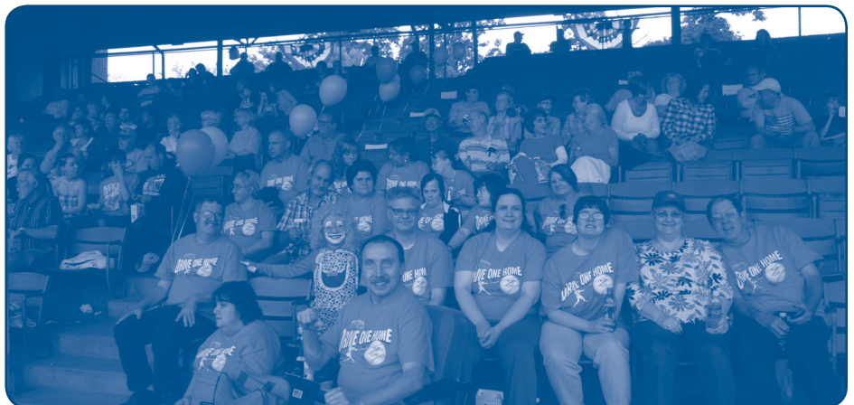
Everyone ready for Otters Baseball!